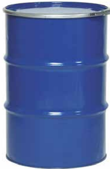
• Steel Drums 216,5 lt net volume Up to 265 kg net weight