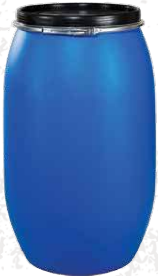
• Plastic Drums 220 lt net volume Up to 265 kg net weight