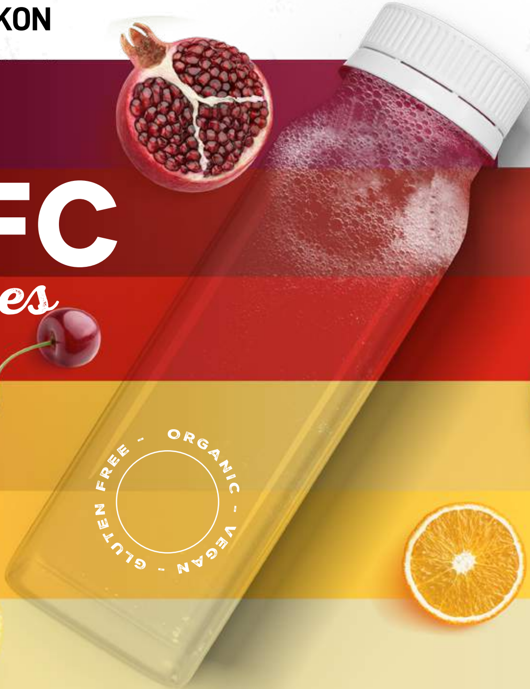
NFC Red Beet