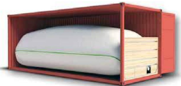
Flexitank upto 24.200 kg net weight

Products can be filled aseptically or non-aseptically with double PE bags.