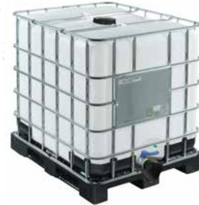
• IBC up to 1000 lt net volume Up to 1350 kg net weight