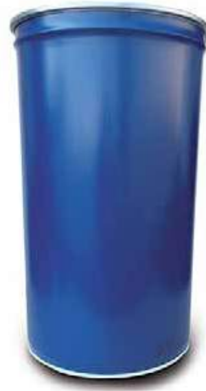
• Conic Drums 218 lt net volume Up to 275 kg net weight